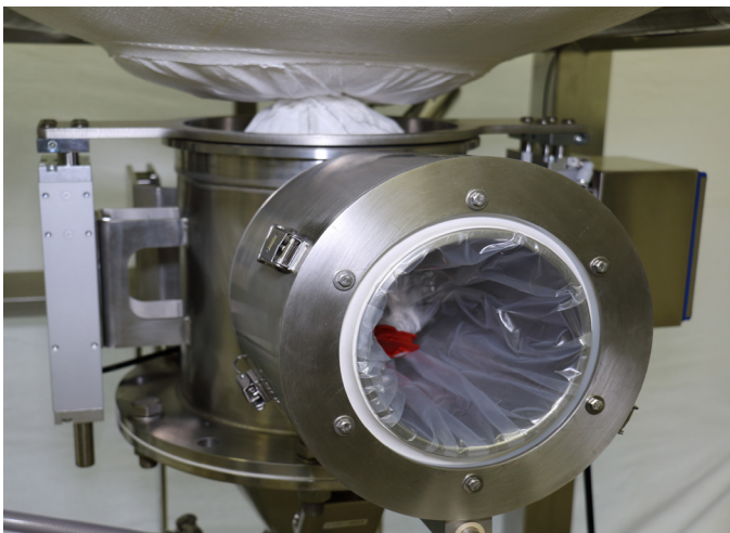
Patent pending SafeDock Connection Head